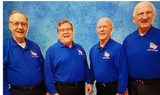
American Spirit Quartet