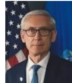
Governor Tony Evers